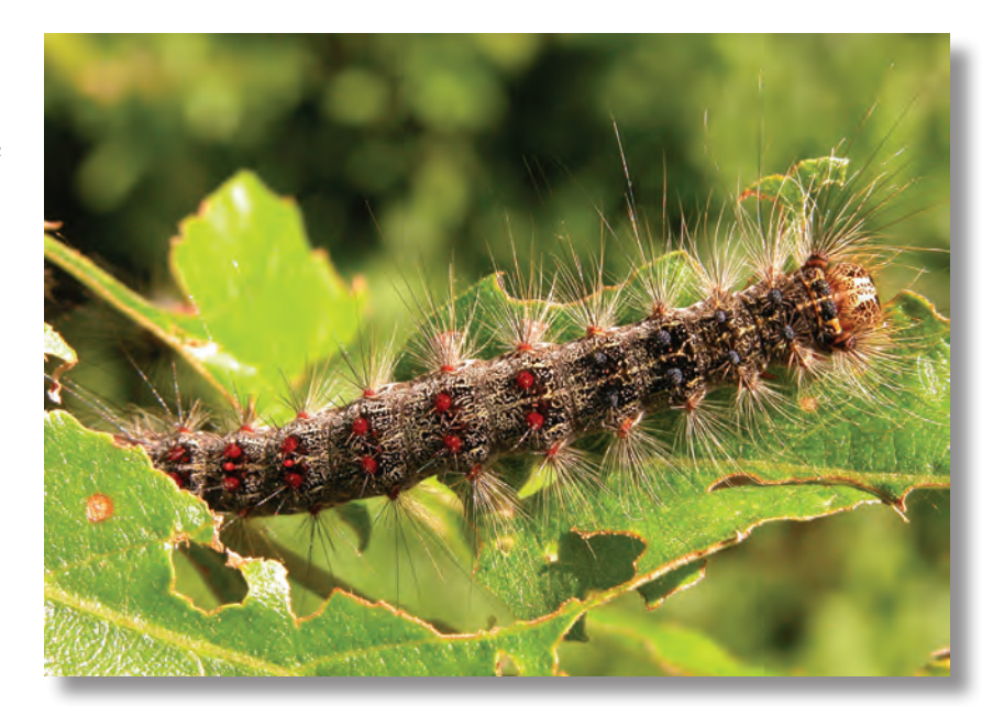
Gypsy moth larva.

Exotic plants and diseases are prevalent within the park. AMore than 260 nonnative species of plants have been documented within the park. Exotic and invasive plants compete with native species, while insect and other pests cause damage to forest trees. Several pests and diseases threaten forest resources, among them the gypsy moth (Lymantria dispar) and hemlock woolly adelgid (Adelges tsugae). Excessive numbers of white-tailed deer use the park as a refuge, resulting in overgrazing of native flora, particularly tree seedlings. Population and housing densities continue to increase in the areas adjacent to the park, which reduces the habitat available for native flora and fauna. On a regional scale, degraded air quality associated with vehicular traffic affects aquatic habitats and sensitive species.