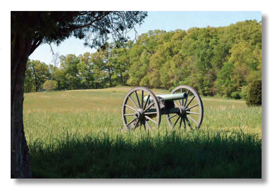
Cannon at the Murphy Farm.

The Shenandoah and Potomac Rivers converge at Harpers Ferry. The rivers are not within the national historical park's authorized boundary but do constitute approximately 24 km (15 mi) of shoreline within the park. In addition to the two major rivers, there are three perennial streams and several canals within the national historical park boundaries. The streams are Elks Run and Flowing Springs in West Virginia and Piney Run in Virginia. The wetlands,