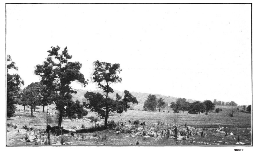
Fig. 1.—View in the Limestone Valley.

{\it Hagerstown stony\ clay\ loam\ in\ foreground,\ silt\ loam\ in\ wheat\ field,\ and\ rolling\ phase\ of\ silt\ loam\ in\ background.}