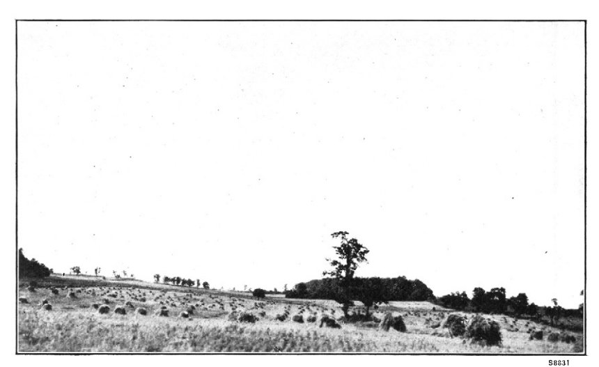
FIG. 2.—WHEAT ON HAGERSTOWN SILT LOAM. Note smooth topography. Rolling phase in background.