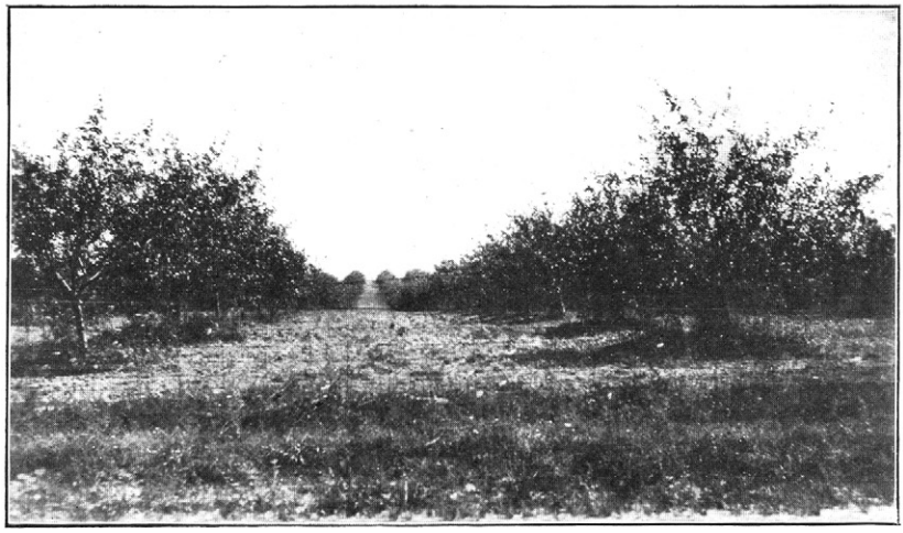
FIG. 2.—APPLE ORCHARD ON BERKS SILT LOAM.

{\it Hagerstown stony\ clay\ loam\ in\ foreground,\ silt\ loam\ in\ wheat\ field,\ and\ rolling\ phase\ of\ silt\ loam\ in\ background.}