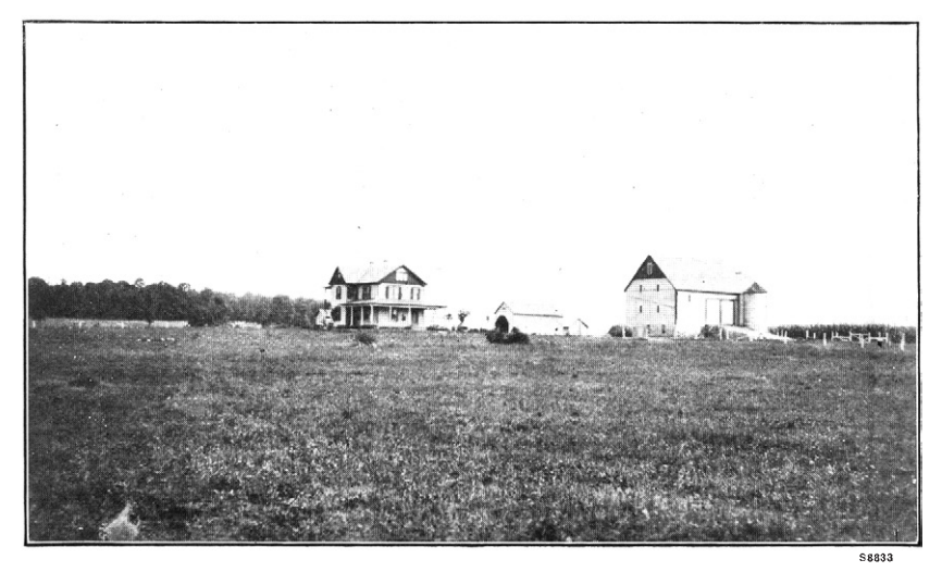
Fig. 1.—Typical Limestone Valley Farm Buildings on Hagerstown Clay Loam.